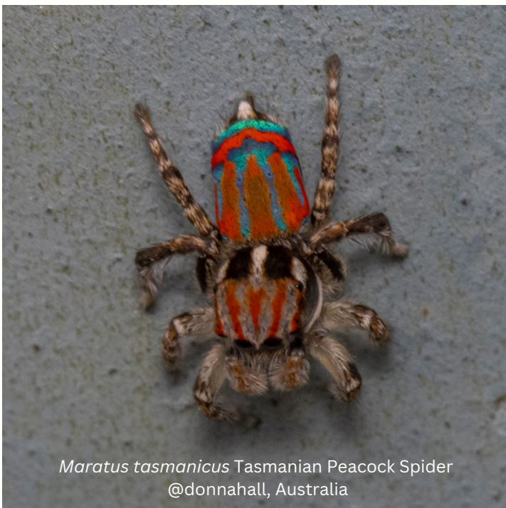
Maratus tasmanicus Tasmanian Peacock Spider

The goal of the Great Southern Bioblitz is to document the flora, fauna, fish and fungi of the Southern Hemisphere while providing a platform for groups, associations, local governments, and individuals to encourage engagement in citizen science across the southern hemisphere. Through the online platform iNaturalist, we hope to increase biodiversity awareness and encourage citizens to contribute to the understanding of their local biodiversity.