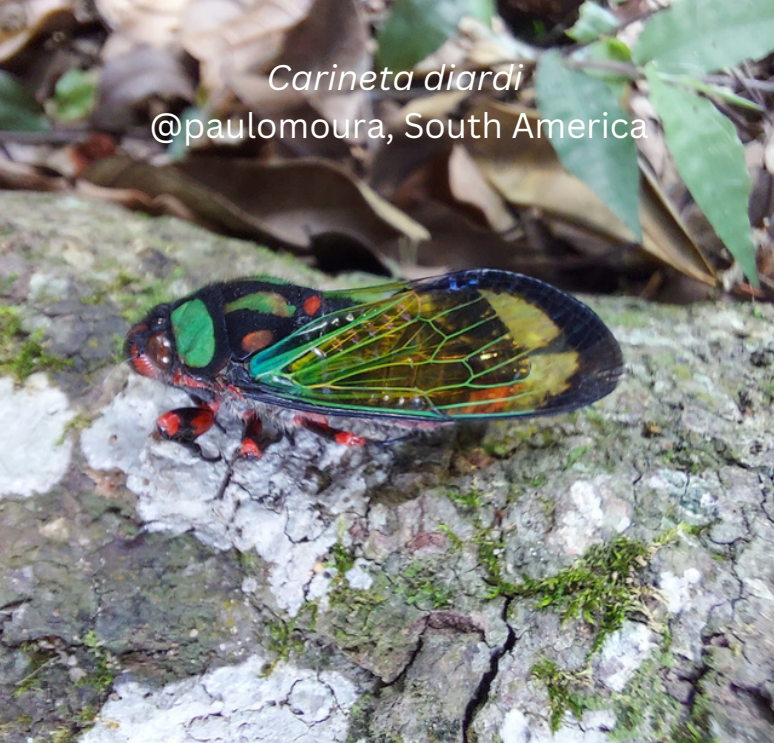
Carineta diardi, South America