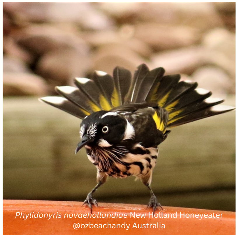
Phylidonyris novaehollandiae New Holland Honeyeater Australia

After your observations are identified, the data are piped into databases like the Atlas of Living Australia and the Global Biodiversity Facility where they can be used by scientists, schools and more for research.