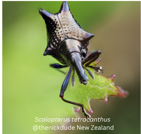
Scolopterus tetracanthus @thenickdude New Zealand