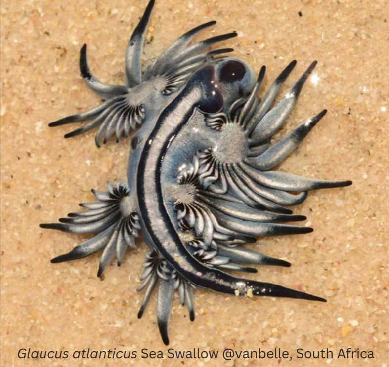
Glaucus atlanticus Sea Swallow @vanbelle, South Africa