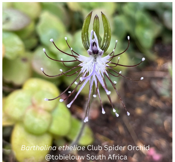
Bartholina etheliae Club Spider Orchid @tobielow South Africa

On Saturday the 25th of November hang up a white sheet outside and shine a light on the sheet. Leave it up for an hour or more and snap some pictures of your winged visitors.